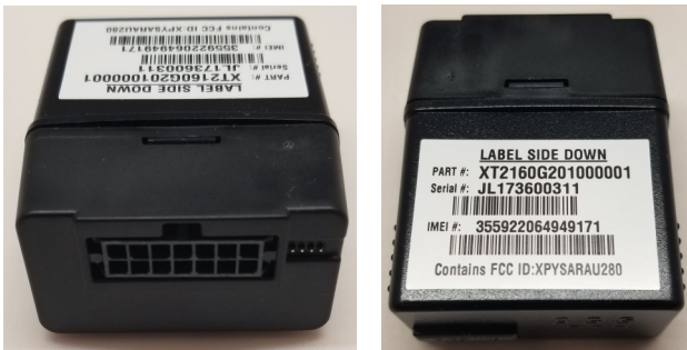
Newest Model VTI